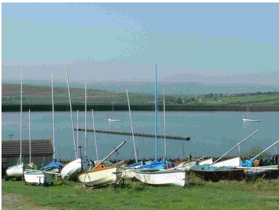
Reva Reservoir sailing club