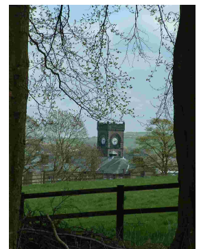
Clock tower of the former Menston Hospital