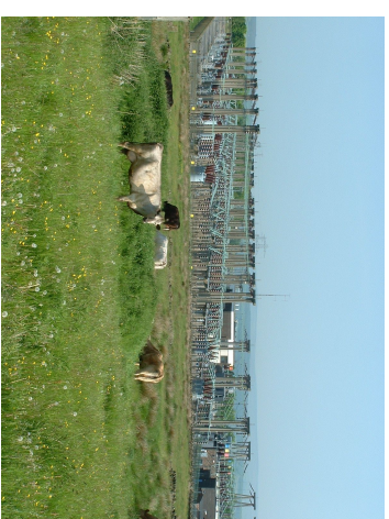
Bradford West Electricity Sub-station