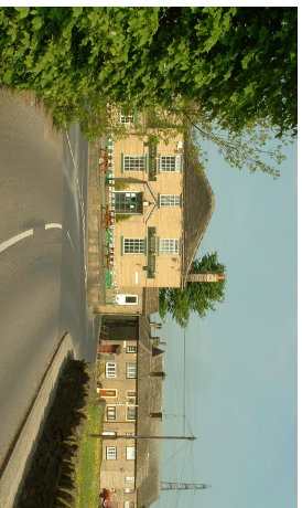
Rock & Heifer