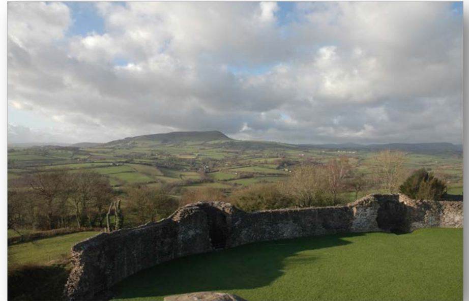
Skirid Fawr from White Castle

Ascent and descent to and from White Castle