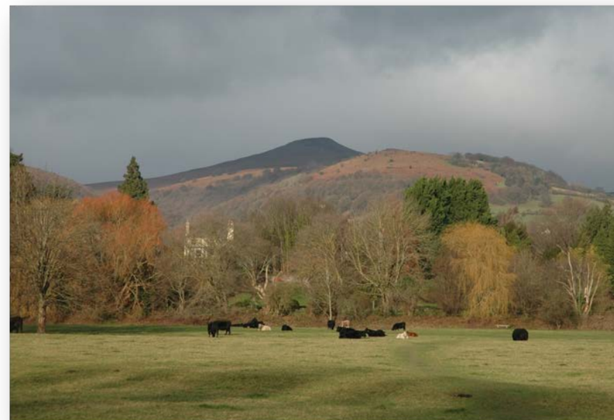
Sugar Loaf from Castle Meadows

Flight of steep steps up to the canal at Llanfoist