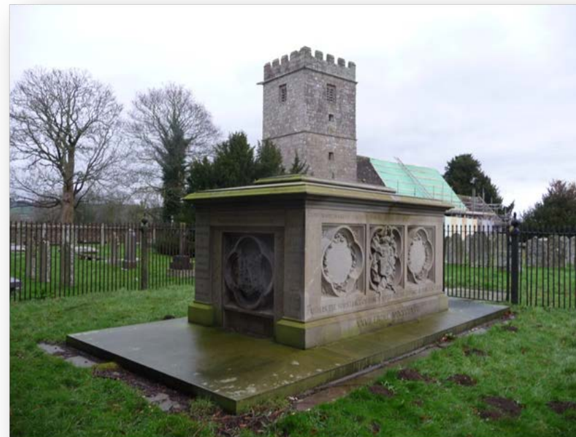
Tomb of Benjamin and Augusta Hall, Llanover Church

No of Stiles: 32 Varied terrain including cross field paths, woodland paths, a long steady ascent, some short steep sections, steps.