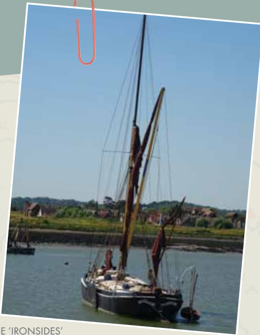
SAILING BARGE 'IRONSIDES' MOORED AT NORTH FAMBRIDGE

This wonderful linear riverside walk starts from North Fambridge railway station, taking you eastward towards the estuary at Burnham-on-Crouch, where you can catch a train to return to the start. Alternatively, you can opt to do a shorter walk by finishing at Althorne railway station and returning to North Fambridge by train. The Crouch Valley offers plenty of opportunities to see birds and boats amid peaceful scenery.