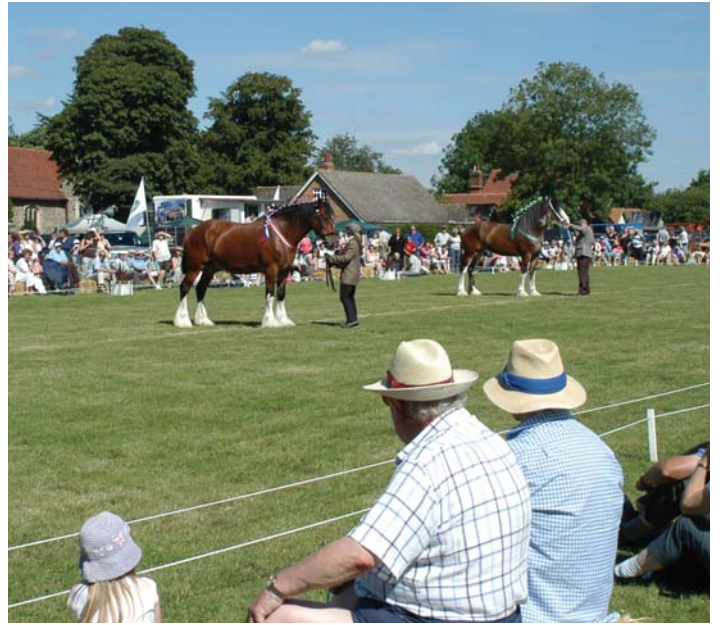
Countess of Warwick Show, Little Easton

L Debden - pretty village on one long main road. 🏠 ✂ 🏠