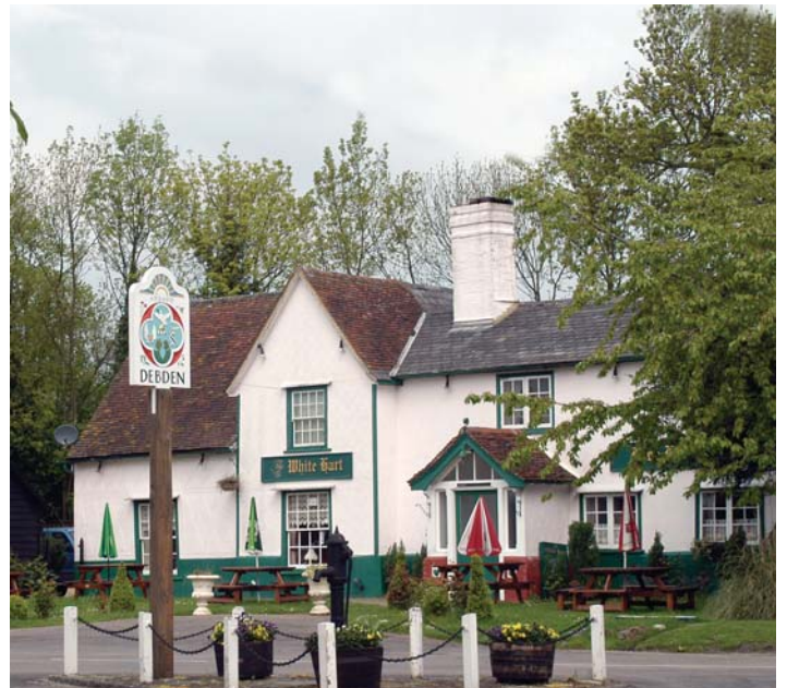
The White Hart, Debden

N Ugley Green - picturesque village set around a large green.