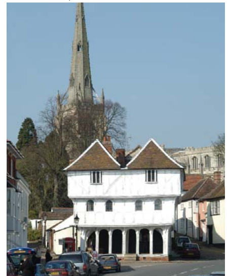
The Guildhall, Thaxted