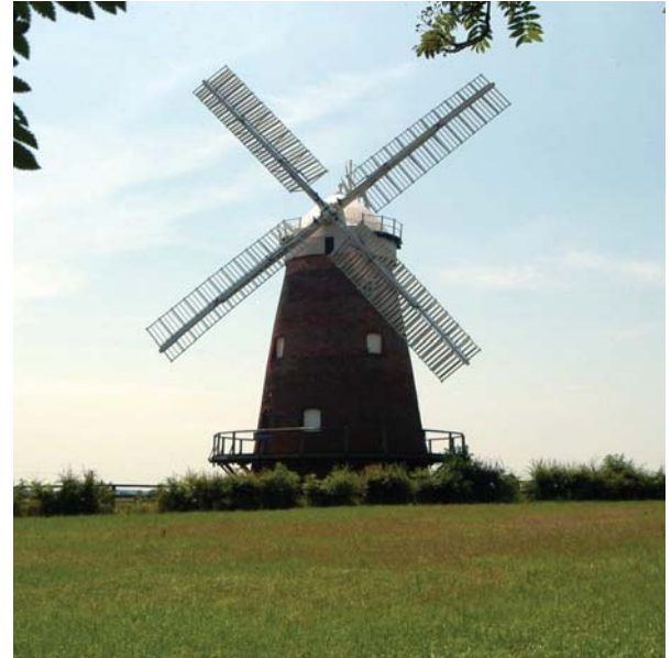
John Webb's Windmill, Thaxted

This cycle ride starts from the historic village of Stansted Mountfitchet. From here the route heads east, into an attractive landscape of gently rolling countryside - set on the borders of Essex and Hertfordshire. Explore quiet narrow lanes leading to pretty villages, with thatched and tiled houses set around greens and ponds. Stop off at Thaxted - noted for its 15th C. Guildhall. Look out for the ancient art of pargetting (raised decorative plasterwork). Along this route you can travel back in time to a reconstructed motte and bailey castle, discover a medieval timber-framed barn and visit John Webb's 19th C. windmill.