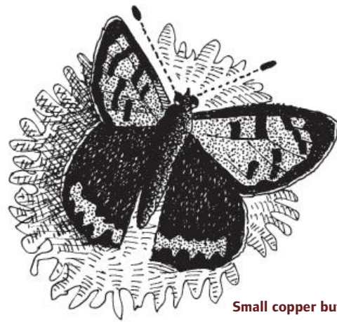
Small copper butterfly