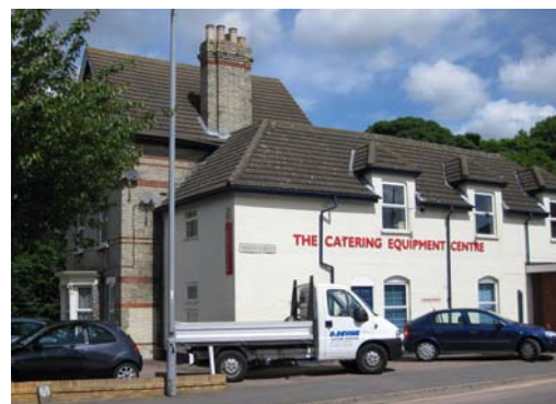
Catering Equipment Centre