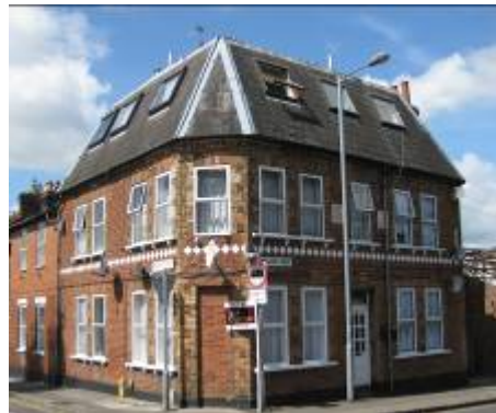
Children's Sick and Convalescent Home