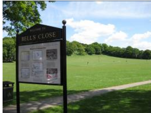
Bells Close Field

The Bells Close Field is part of People's Park , and stopped further houses being built in this direction. To the entrance of the park there is a board with further information about its history. The slope in People's Park is great for sledging when it snows – don't forget your woolly hat!