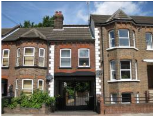
Clues to the hat industry on Clarendon Road