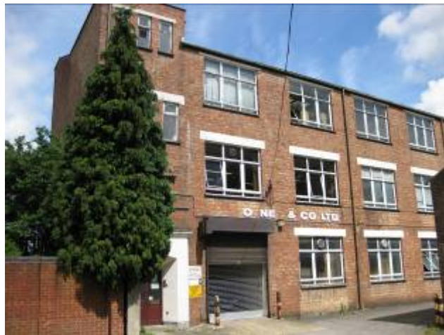
Olney & Co

Continue along Old Bedford Road back towards Wardown Park Museum .