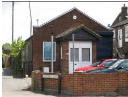
Former Kerrie Hats

11) This building was once occupied by a hat company called Kerrie Hats .