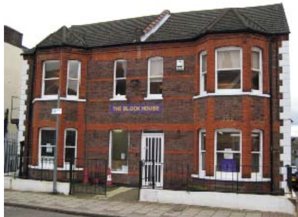
K.R. Snoxell and Sons

This is a well-known firm who make the Luton “Civic Boater”, named because they were supplied to the council. Snoxell also make a range of hats for summer and winter wear both for shops and individual hat designers.