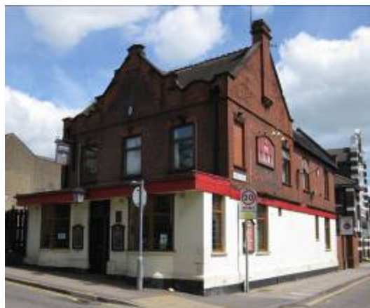
The English Rose public house

9) The English Rose public house was originally called The Rabbit (renamed The Wabbit in 1983). It was named after the former hamlet here of Coney Hall . In the early 19 th century Coney Hall consisted of two rows of terraced cottages facing each other across the road to Bedford. In about 1845 two end cottages were converted to a pub, and in 1908 these were replaced by the present building. The remaining cottages were demolished in the 1960s and the site became the pub garden. In the 1950s the landlord's son, David Hamilton married the film star Diana Dors , who regularly helped out behind the bar. The pub was renamed the English Rose in memory of Princess Diana.