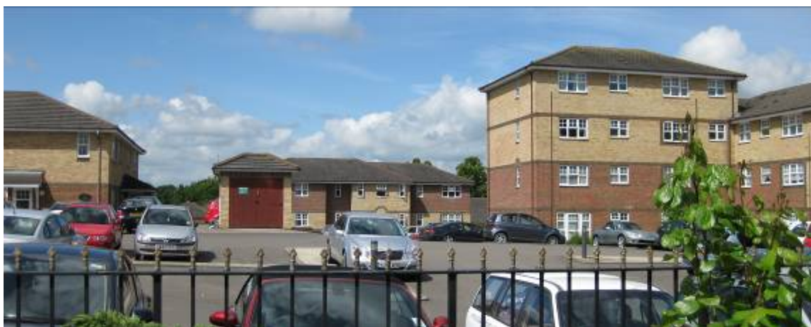
Former site of Lye's Dye Works