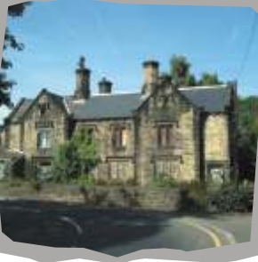
The Manor House (See Waymarker 3)