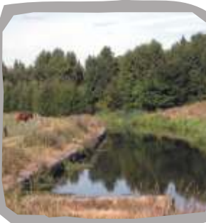
Barnsley Canal (See Waymarker 5)