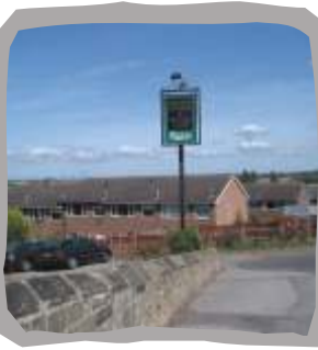
Walton Social Club Car Park (See Waymarker 1)