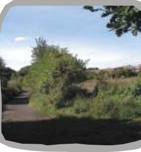
Dirt Road to Allotments (See Waymarker 2)