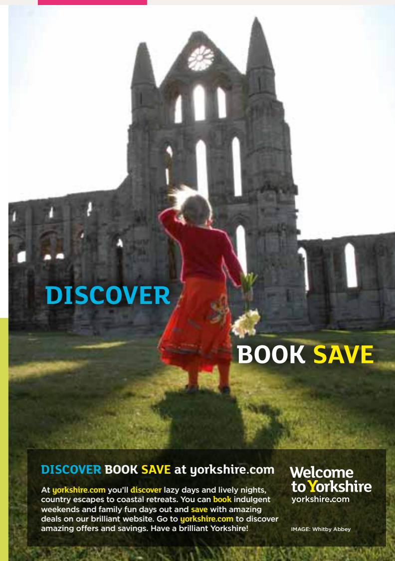
IMAGE: Whitby Abbey