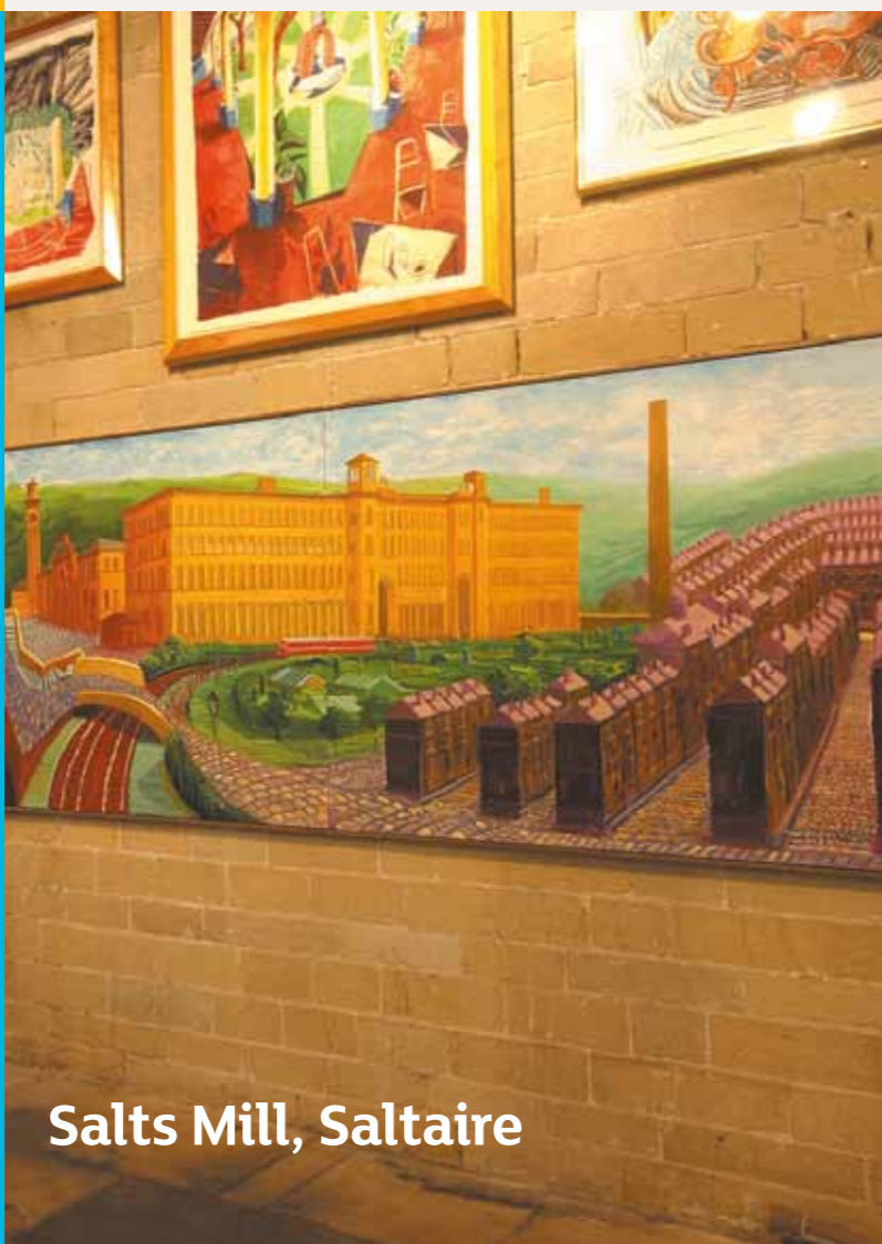
Salts Mill, Saltaire

Tel: 01262 678378 fishandchipsat149.co.uk