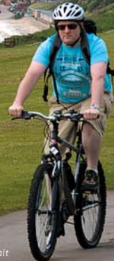
Leaving Bridlington © Jonathan Tait

Map © Crown Copyright 2010. All rights reserved. Licence 0100031673