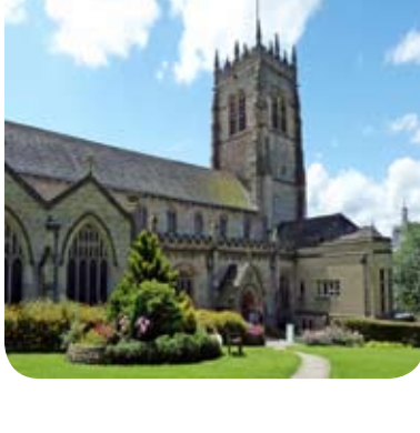
THE CATHEDRAL CHURCH OF ST PETER 1 Stott Hill, Bradford. BD1 4EH Arrival 2.45pm. This is the final place of worship on our walk.