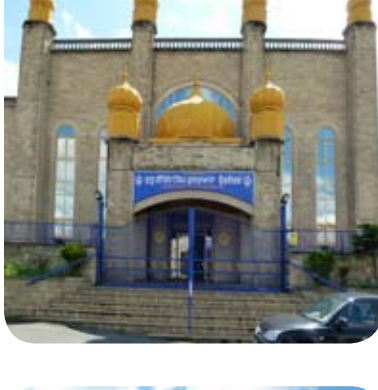
GURU GOBIND SINGH GURDWARA Gobind Marg, Leeds Road, Bradford. BD3 9JN Arrival 1.15pm, leaving at 2.30pm. (Whilst at the Gurdwara, a vegetarian meal ('Langar') is available, which is provided free to all).