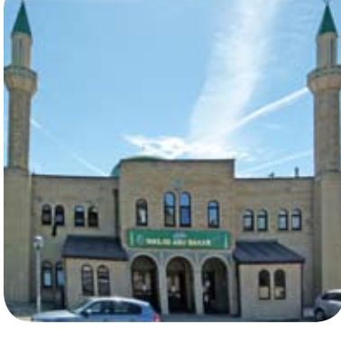
ABU BAKAR MASJID 38 Steadman Terrace, Bradford. BD3 9NB Arrival 11.00am, leaving at 11.45pm.