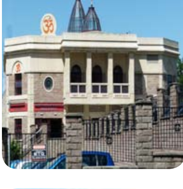
SHREE LAKSHMI NARAYAN HINDU MANDIR 321-341 Leeds Road, Bradford. BD3 9LS Arrival 12.15pm, leaving at 1.00pm.