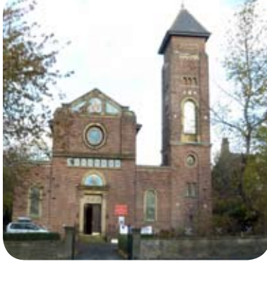
ST PETER'S ROMAN CATHOLIC CHURCH 651 Leeds Road, Bradford. BD3 8EL 10.00am, leaving at 10.45am.

The Bradford Faith Trail, which began as part of 'Treasures Revealed' several years ago, is a gentle walk of around a mile and a quarter visiting places of worship of five different faiths. The walks take place on the first Saturday of each month, between Easter and Christmas. The route, with approximate times is now: