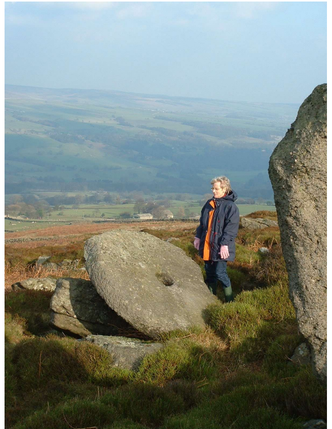
An almost complete millstone, carved from the now disused quarry near Windgate Nick.

between the grassy mounds and emerges in front of the remains of a derelict dry stonewall. Turn right here and walk the short distance to the end of the wall before turning left to join a well-trodden footpath. Follow this path across the field and go over a stile at the far end and continue by following the fence line on your left down to a small gate. Go through the gate and straight ahead across the next field to a kissing gate, leading out onto the Addingham Bypass. Cross the road and follow the fence downhill to the left to another kissing gate, go through into a field and continue downhill to the gate at the bottom from where you started your walk.