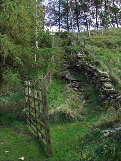
Steep steps at Hollings

follows the wall on your right steeply uphill before finally reaching a second shorter flight of steps leading up to a stile over a stone wall out onto Sun Lane. At this point public transport users can finish their walk by turning left uphill to the bus stop and Haworth village. To continue turn right downhill for 100yds (91m) or so before crossing the road to