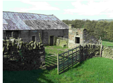
Near Enfield Side