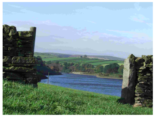
Lower Laithe Reservoir