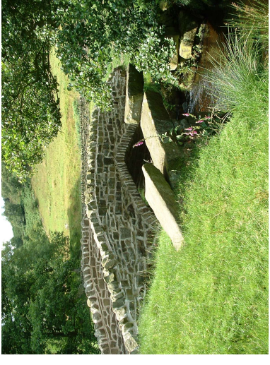
Clapper and packhorse bridges at Newsholme Dean