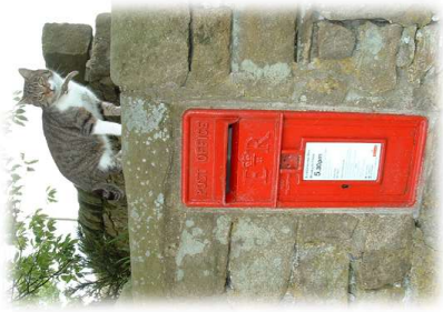
Postbox at Newsholme village