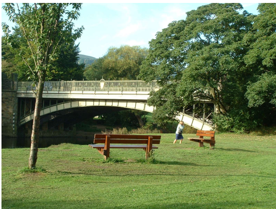
New road bridge, Ilkley