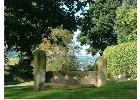
The stocks at nesfield