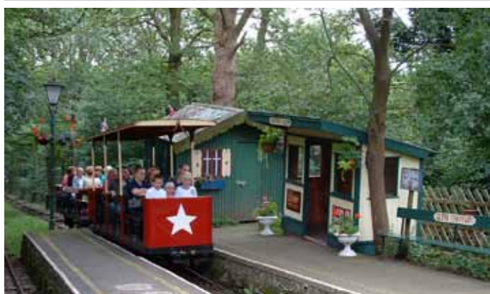
Shipley Glen Tramway