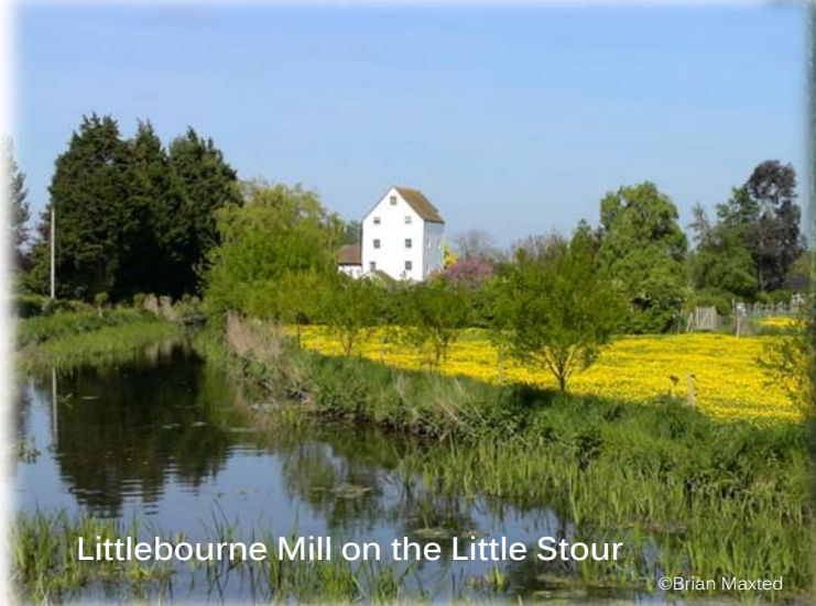
Littlebourne Mill on the Little Stour