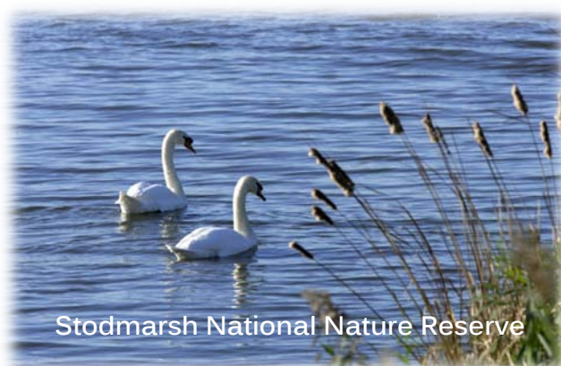
Stodmarsh National Nature Reserve

Alternatively, carry on to Grove, where you can park your bikes at the Grove Ferry and chill out in Stodmarsh National Nature Reserve . The Grove Ferry also provides boutique accommodation, offering another convenient stopover point and a place for dinner.