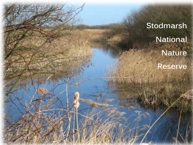
Stodmarsh National Nature Reserve

The beautifully preserved medieval town of Sandwich and the neighbouring village of Worth have numerous comfy hotels, b&bs and inns where you can stay, as well as a wide variety of places to eat. Hang up your boots for the evening and relax!