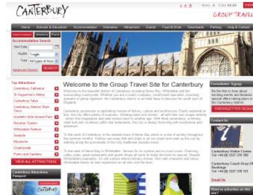
Visit Canterbury groups site