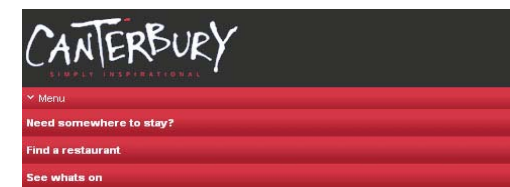
Welcome to Canterbury

Welcome to the fabulous district of Canterbury, including Herne Bay, Whitstable and the surrounding Countryside. You can now book your accommodation online, find out about upcoming events, choose somewhere to eat, discover things to see and do, all here in one place.