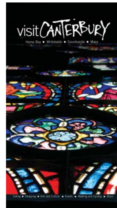
2011 Canterbury District Guide