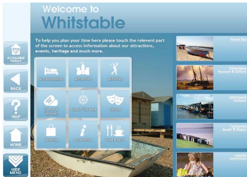
Coastal town touch screens