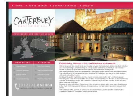
Visit Canterbury conference site