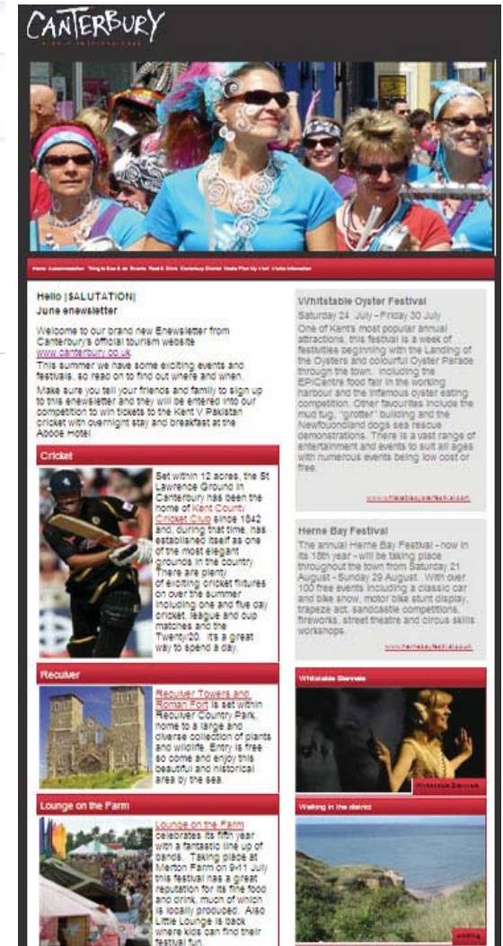
Visit Canterbury e-newsletter

Some examples of the benefits of becoming a Visit Canterbury Partnership Member