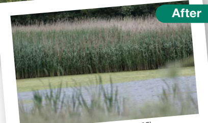
Clearing old sewage works (1995)