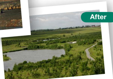
Coalfield North opencast mine