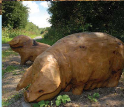
Right: Curly Coat pigs

The Water Rail Way , the path beside the River Witham that connects Lincoln to Boston, was named in a competition both for its former life as a railway line but also for the abundant bird life that can be seen in this green corridor. The shy Water Rail has been seen from this path.