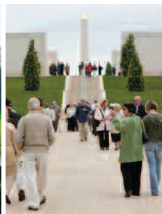
National Memorial Arboretum

For information on accommodation rates that will suit your budgets, details of accessibility and where groups can visit please contact groups@goLeicestershire.com or call Helen on 0116 266 9999.