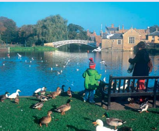
Chinese Bridge, Godmanchester