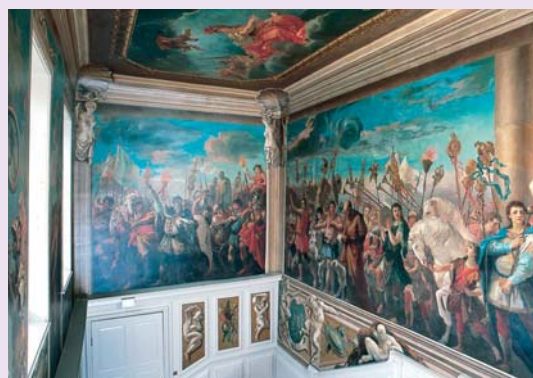
Kimbolton Castle, Pellegrini Murals