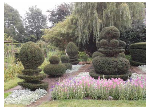
Chess pieces in the gardens at The Manor