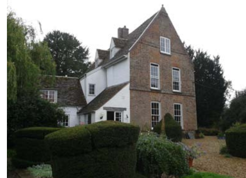
The Manor in Hemingford Grey