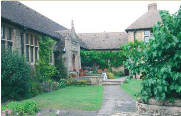
The Norris Museum, St Ives