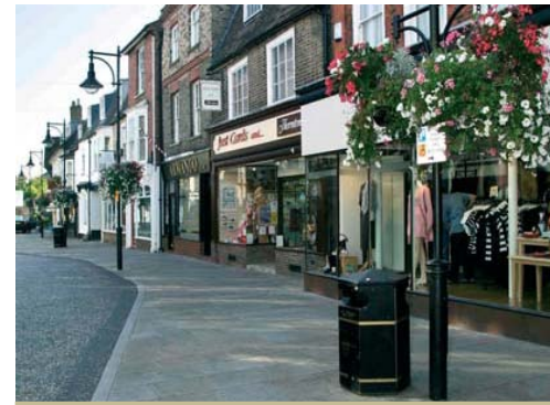
Bridge Street, St Ives

Disabled facilities: Disabled access is currently limited in the house, but assistance is available to bring visitors in wheelchairs into the main ground floor room, where it is possible to appreciate many of the exhibits. Wheelchair accessible toilet. Ramp access from the tow path to the garden. There is a short walk from where the coach drops off to The Manor, but Diana Boston (Lucy Boston's daughter-in-law) is happy to collect those who have difficulty walking.