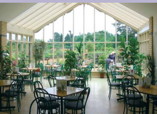
The Walled Garden Centre Restaurant, Elton