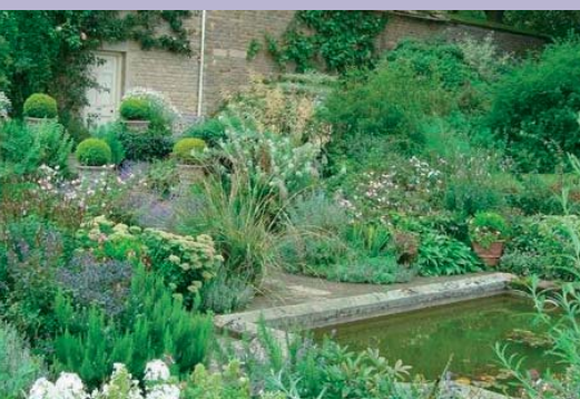
Gardens, Elton Hall