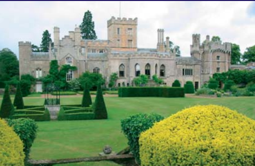
Magnificent Elton Hall