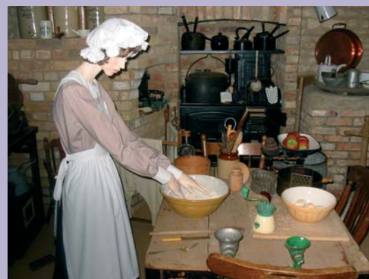
An example of Victorian living at the Ramsey Rural Museum