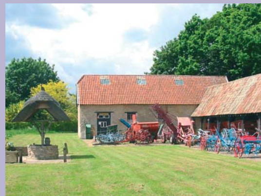
Ramsey Rural Museum