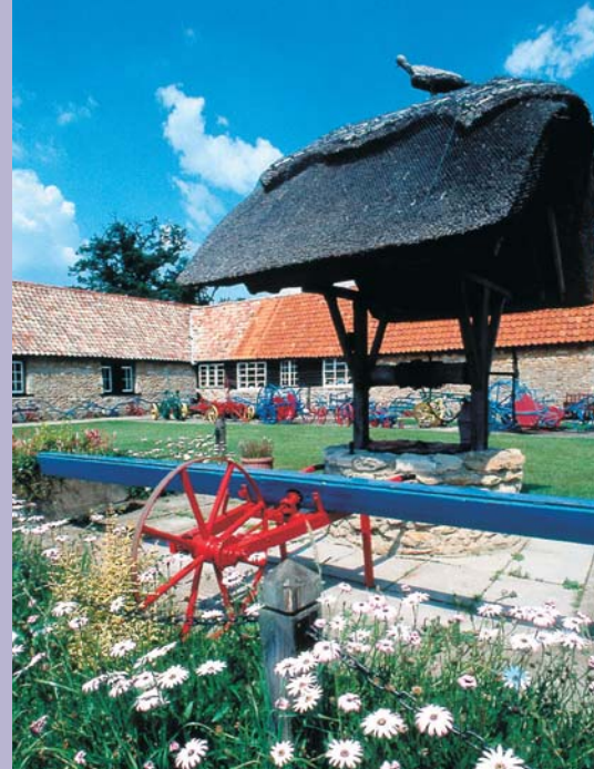
Ramsey Rural Museum

Farmers' Markets: For details about Farmers' Markets in Ramsey, please call 01487 813612.