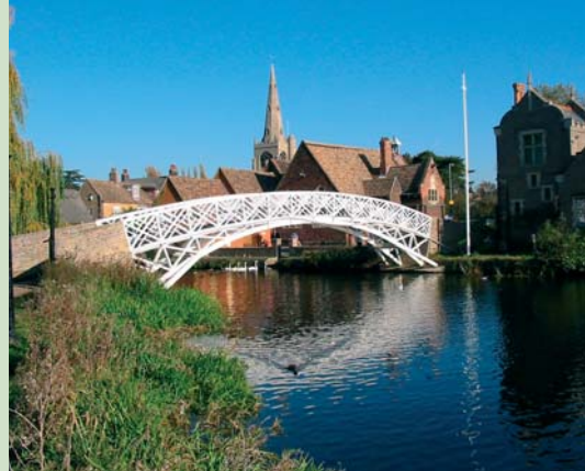
Chinese Bridge, Godmanchester