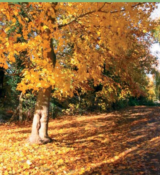
Godmanchester in Autumn