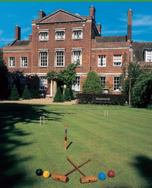
A view of Island Hall