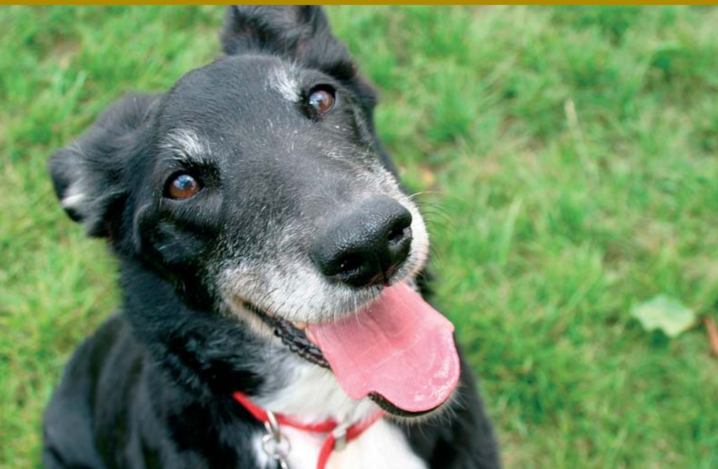
Wood Green Animal Shelter, Godmanchester