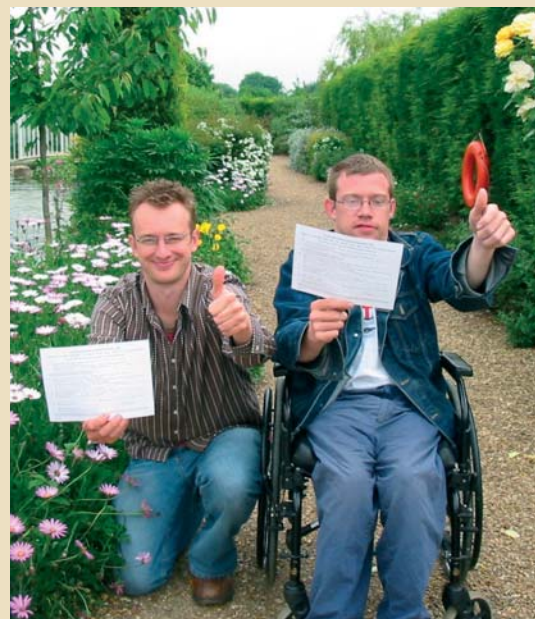
Happy visitors at Wood Green Animal Shelter, Godmanchester