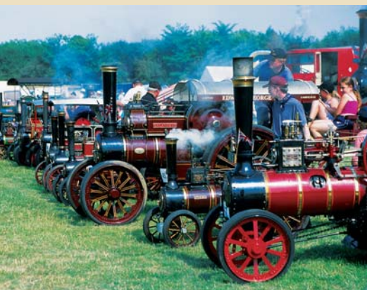
Steam Rally at Wood Green

The Godmanchester Shelter has a full events list for the year ahead. All details can be found on our website, www.woodgreen.org.uk .