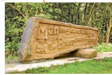
The Flowing River by Anthony Lysycia. 2008, Sandstone. Harlow Lock