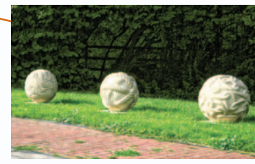
Short Stort Thoughts by Graeme Mitcheson 2007, Peak Moor Sandstone Burnt Mill Lock