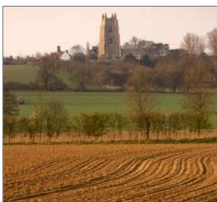
Stoke by Nayland

All three rides begin and end at local railway stations so why not leave the car at home.