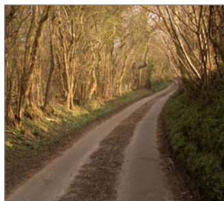
Quiet lanes to enjoy