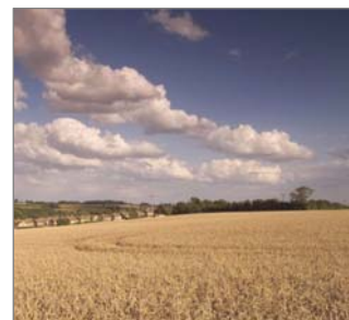
The Stour Valley