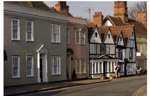
Dedham High Street

Dedham is a great place to stop off as there are plenty of places to enjoy refreshments in the tea rooms, pubs and restaurants. The village sustains a wide variety of individual shops from a butcher to a bookshop and a browse along the High Street is a must. There are bike racks located near to the war memorial.