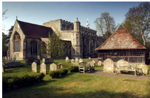
East Bergholt Church & Bell Cage

From East Bergholt the route continues to Holton St Mary and joins the National Cycle Network Route 1 at point 11. At point 12 follow the short cut marked in green through Higham and then across to Stratford St Mary at point 78.