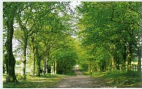
Graces Walk E6