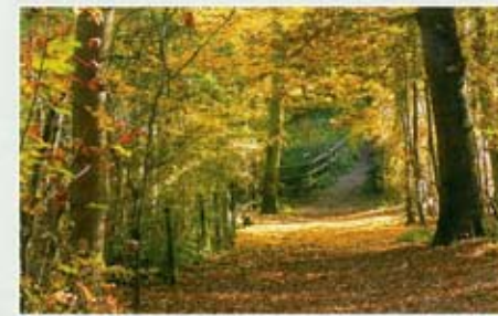
Little Baddow Heath L7