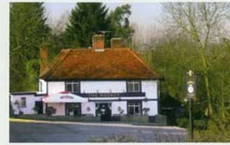
The Rodney H4