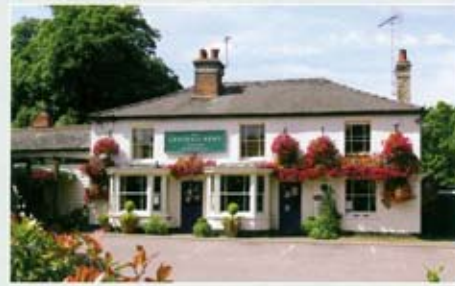
The General's Arms J5