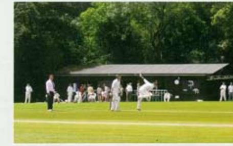
The Sports Field H6