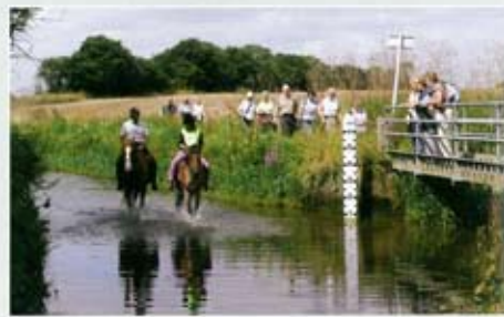
The Ford D5