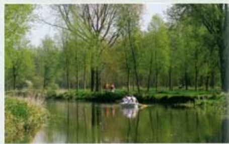
River Chelmer and Towpath G2