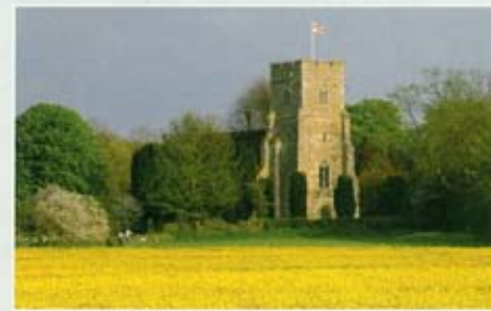
St. Mary's Church E3