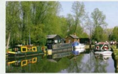
Paper Mill Lock H2