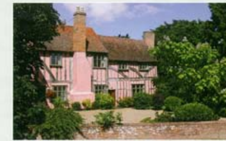
Little Baddow Hall E3