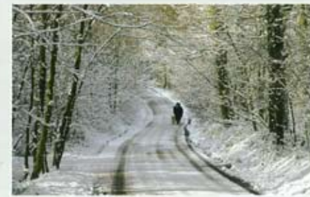
Riffhams Chase H6