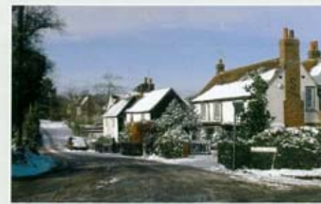
Colam Lane H5