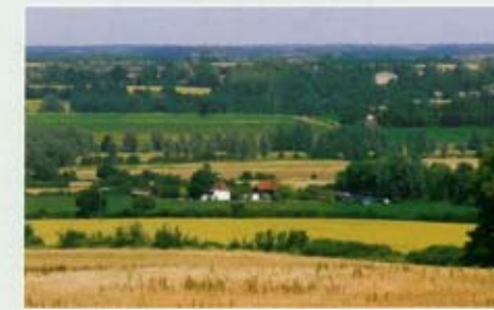
View of the Chelmer Valley J4