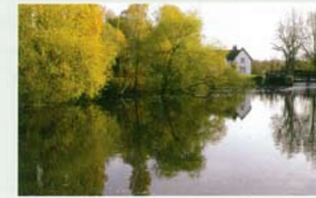
Little Baddow Lock D3