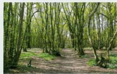
Holybread Wood G3

Whether it is winter, spring, summer or autumn there is much to see and enjoy whilst walking in this beautiful area of Essex.