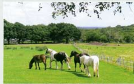
Pheasanhouse Farm K6