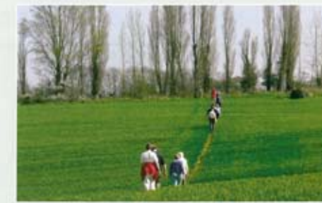
Millennium Walk E5