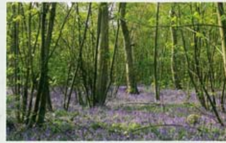
Blake's Wood G6