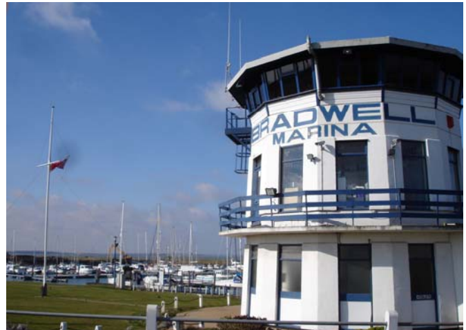
Bradwell Marina Tower