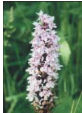
Common Spotted Orchid