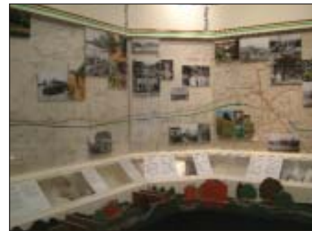
Inside Rayne Station

Please use the Flich Way with consideration for others. Motorcycles are not allowed. Walkers and cyclists should note that at certain times of the year the Flich Way may be muddy.