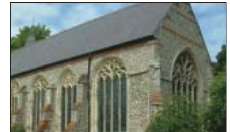
The church at Little Dunmow

The name the Flich Way comes from the famous medieval Flich Ceremony, held in the village of Little Dunmow. This ceremony was originally set up by local Augustinian monks. It involved giving a flich (a large piece of bacon) to couples who had not argued in marriage after a year and a day. Little Dunmow makes an excellent stopping off point along the route.