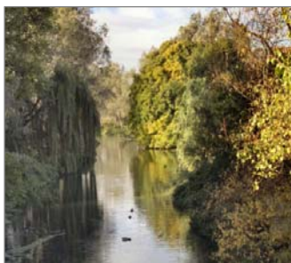
The River Stour

Whether you would like a 2 or 3 day walking break or just a day out walking in the countryside, the Dedham Vale has something for you.