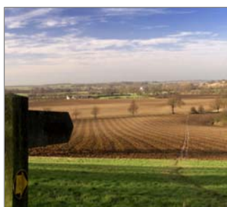
Stour Valley Path