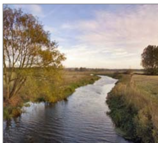
The River Stour

Constable Country is easily accessible on foot from Manningtree rail station. Alternatively, you can leave your car in one of the car parks at East Bergholt, Flatford or Dedham and take in the countryside at the pace that Constable did himself.