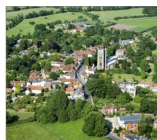
The village of Dedham