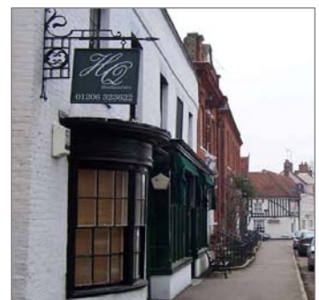
Dedham High St