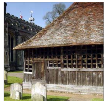
The Bell Cage, East Bergholt