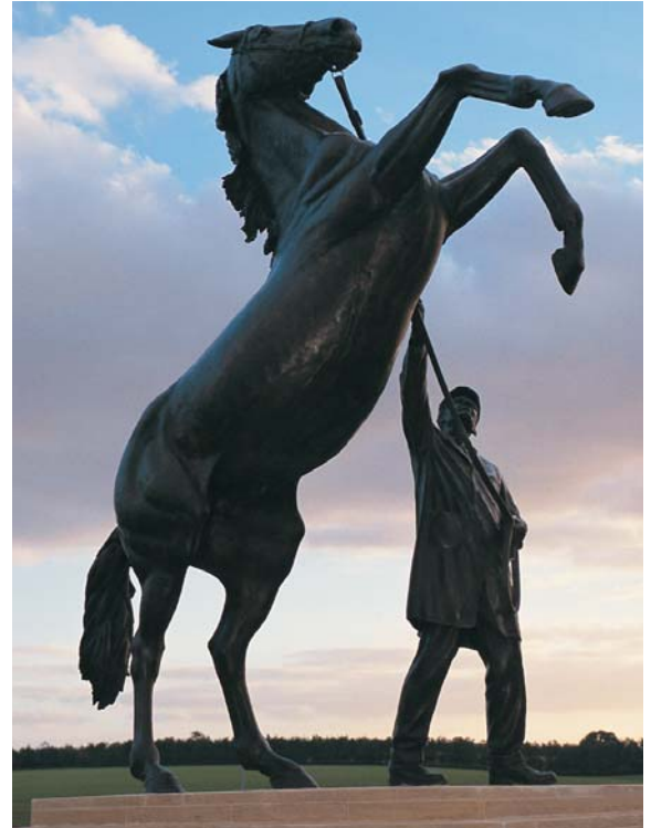
Newmarket Stallion Bronze Statue (nr. entrance of The National Stud)

This cycle ride starts from the horseracing capital of the world, Newmarket. From here the route heads north west to the 'Fen edge' villages of Burwell, Reach and Swaffham Prior. These former inland ports date back to Roman times, with their ancient waterways or 'lodes'. In complete contrast, the return journey takes you into a rolling patchwork of chalk grasslands, paddocks and woodland, home to lavish stud farms. Here you can explore villages with thatched and colour-washed cottages. Along this route you can discover the 'tragic tale of the flaming heart', visit a 15th C. Packhorse Bridge and take a stroll along the Roman road - The Devil's Dyke.