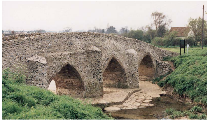
Packhorse Bridge, Moulton

20 At the X-roads with the B1061, go SA onto Stetchworth Road, SP 'Stetchworth 1, Woodditton 2 1/2'. ⚠