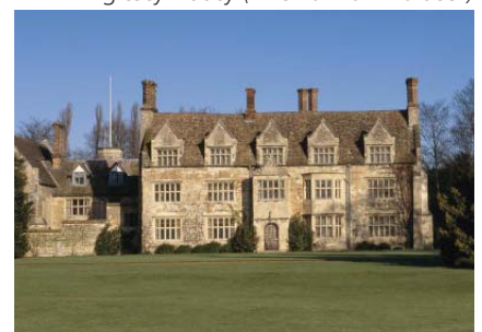
Anglesey Abbey (nr. Swaffham Bulbeck)