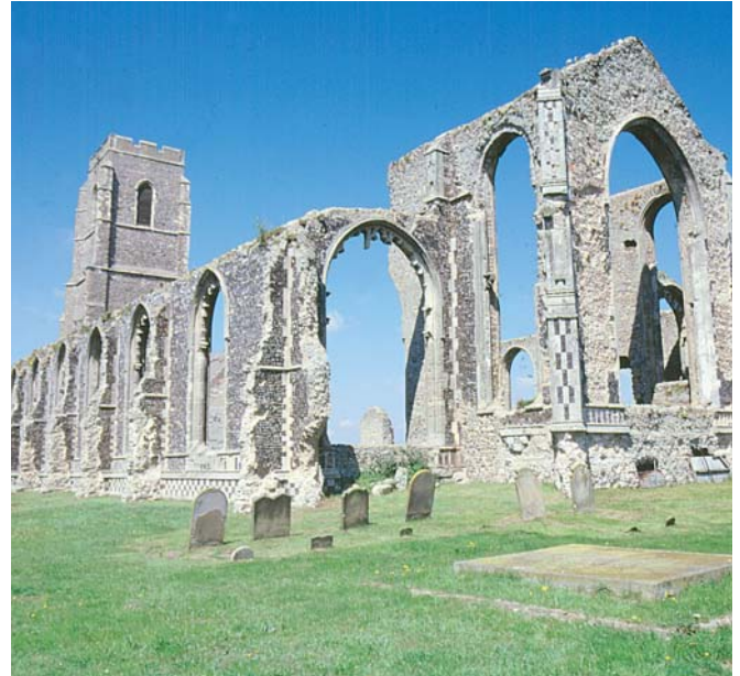
St. Andrew's Church, Covehithe

This cycle ride starts from the village of Carlton Colville. From here the route heads south into a gently rolling landscape of attractive villages, old country estates and ancient woodlands (copses). Take time to visit a plethora of historic churches, some of flint, some of thatch. Then its east to the unspoilt coastline, with its crumbling cliffs and rare plant/bird life. Along this route you can discover a 'church within a church', take a ride aboard a 1930's tram and stroll along a seaside pier.