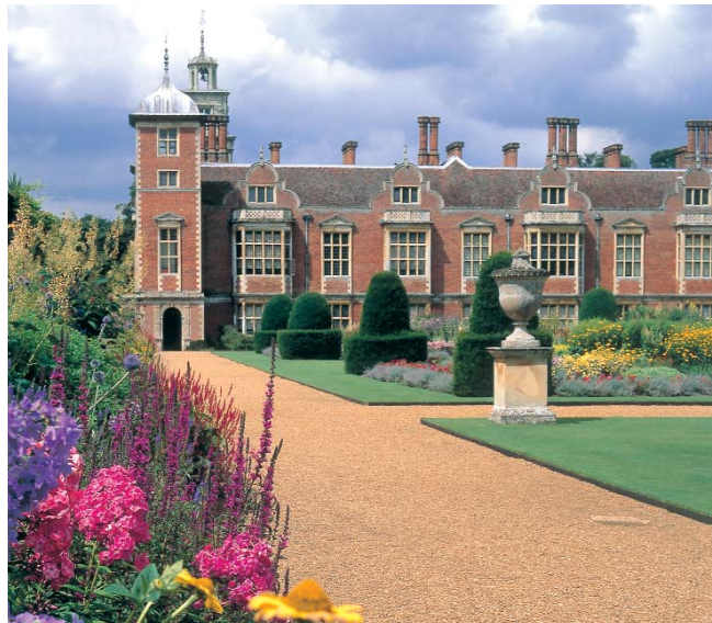
Blickling Hall, Garden and Park

This cycle ride starts from the historic market town of Aylsham. From here the route heads north along quiet county lanes, through gently rolling landscapes and picturesque villages, such as Itteringham, Baconsthorpe and Hanworth. Here you can explore the grand country estates of the rich and famous - from the Jacobean Blickling Hall, with its fine tapestries and furniture, to the rambling roses of medieval Mannington, and 17th C. Felbrigg Hall with its walled garden. Along this route you can discover some of Norfolk's round-towered churches, visit the 15th C. remains of Baconsthorpe Castle and take a ride on a real narrow gauge steam railway.