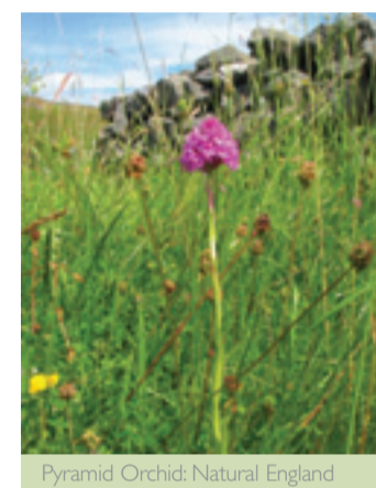
Pyramid Orchid

Grasslands vary as habitats, according to the pH of the soil and whether they are managed for grazing or as hay meadow. In the calcareous (alkaline) limestone dales of the White Peak, you'll see orchids , rock rose and small scabious .