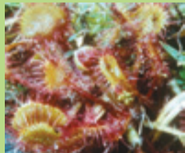
Sundew: Derbyshire Wildlife Trust

Two rare insect-eating plants live in the Peak District, the sundew (at Longshaw) and the butterwort (at Monk's Dale, Wye Valley). Their sticky leaves trap and curl round insects, secrete digestive enzymes and absorb the insect juices - so these plants can thrive in nutrient-poor soils.