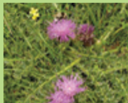
Stemless Thistle: Natural England

Wildlife north meets wildlife south in the Peak District, and many species are at their geographical limit. The stemless thistle cannot live much further north. The globe flower is not found further south. Climate change will therefore have an impact on the region.