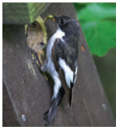
Pied Flycatcher: RSPB

Forest covered much of the Peak District until people cut down the trees to make farmland and homes. But a few patches of ancient woodland remain, mostly in steep-sided valleys. You'll find some of the finest ash woodlands in Europe on the White Peak dalesides. Sycamore, wych elm and hazel grow here too. Spring flowers thrive on the light in ash woodlands, because ash leaves come late and form quite an open canopy. Oak and birch dominate the upland woodlands you'll see in the cloughs (valleys) of the Dark and South West Peak. Padley Gorge and Coombes Valley are glorious examples. Visit in spring for the bluebells and autumn for all sorts of fungi . Listen out for the many bird species such as pie d flycatcher and look out for the nests of the scarce northern wood ant .