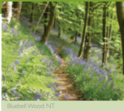
Bluebell Wood: NT

Forest covered much of the Peak District until people cut down the trees to make farmland and homes. But a few patches of ancient woodland remain, mostly in steep-sided valleys. You'll find some of the finest ash woodlands in Europe on the White Peak dalesides. Sycamore, wych elm and hazel grow here too. Spring flowers thrive on the light in ash woodlands, because ash leaves come late and form quite an open canopy. Oak and birch dominate the upland woodlands you'll see in the cloughs (valleys) of the Dark and South West Peak. Padley Gorge and Coombes Valley are glorious examples. Visit in spring for the bluebells and autumn for all sorts of fungi . Listen out for the many bird species such as pie d flycatcher and look out for the nests of the scarce northern wood ant .