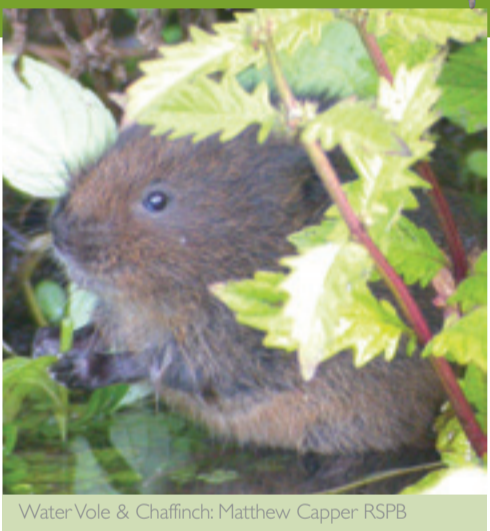
Water Vole & Chaffinch

In the Dark and South West Peak there are small upland streams that flow down through cloughs, joining rivers in the lower valleys. Upland stream plant life is sparse. The White Peak rivers are rich in plant life, with carpets of watercress and crowfoot . Some provide a home to the rare white-clawed crayfish . Many of these water courses are seasonal and only flow when there's plenty of rain. Fish in the White and South West Peak upland streams include bullhead and brook lamprey . If you're lucky you might see a water vole. This endangered species lives in many Peak District waters.