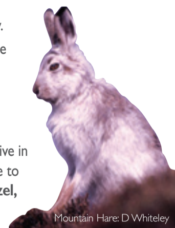
Mountain Hare: D Whiteley

Moorlands provide a mosaic of habitats in the uplands of the Dark and South West Peak. Here life is harsh and plants can only grow low. Heather and acidic grasslands dominate the drier land. Where it is wetter, peat accumulates and cotton grass and mosses grow. Plants such as cloudberry and cranberry thrive in the wet flushes, blanket bogs, scrub, streams and gritstone edges. The bogs are carbons sinks - as important as tropical rainforest for removing carbon pollution from the air.