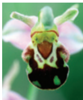
Orchid