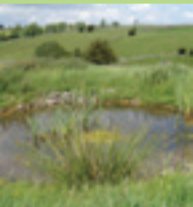
Dew pond: Emma Mortimer

Before piped water, people dug ponds for water for livestock. They are a valuable habitat for many aquatic plants, invertebrates and amphibians - especially great crested newts , Britain's largest and rarest newt. Look out for circular stone or concrete-lined ponds in fields on the limestone.