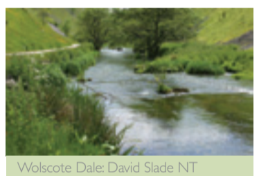
Wolscot Dale: David Slade NT

In the Dark and South West Peak there are small upland streams that flow down through cloughs, joining rivers in the lower valleys. Upland stream plant life is sparse. The White Peak rivers are rich in plant life, with carpets of watercress and crowfoot . Some provide a home to the rare white-clawed crayfish . Many of these water courses are seasonal and only flow when there's plenty of rain. Fish in the White and South West Peak upland streams include bullhead and brook lamprey . If you're lucky you might see a water vole. This endangered species lives in many Peak District waters.