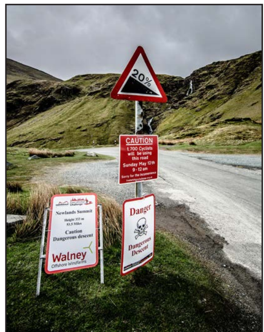
Newlands Pass

Follow the road as it bends slowly left to Braithwaite, where you follow the road until it gives way at a T-junction in the village (60 miles). In our annual event the first checkpoint is here, be sure to use the electronic timing by Race Timing Systems Marshals will be here to help you. You then join the road to climb up to the top of Whinlatter Pass.