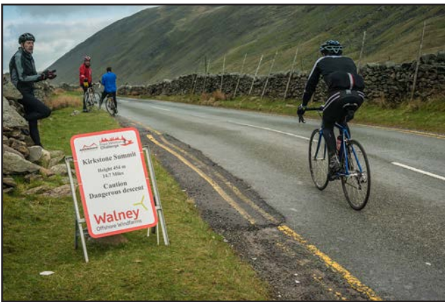
Kirkstone Pass

Cross the main road carefully when you leave the sports field – no rush, since the start timing point isn't until you're on the other side of that road. Then you're off, following the main A591 down to Ambleside, where you keep right at the mini-roundabout and then follow the road through the town and on south to Waterhead (head of Lake Windermere). Here you go straight on at the traffic lights, towards Windermere, but after only just over a mile get ready for bottom gear, since you now turn left (6 miles) up the very steep Holbeck Lane climb to Troutbeck.