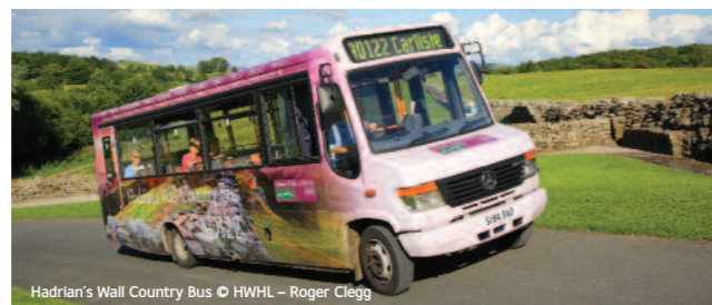
Hadrian's Wall Country Bus

The Hadrian's Wall Country Bus (AD122) is an easy and sustainable way to get around. Goes to all the right places and some take bicycles. For more information pick up a timetable from local Tourist Information Centres, phone 01434 322002 or visit www.hadrians-wall.org .