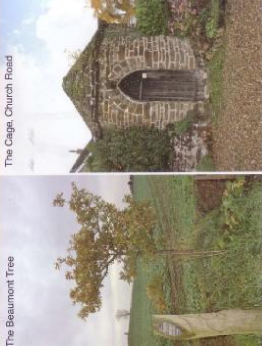
The Cage, Church Road