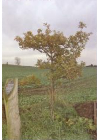
The Beaumont Tree