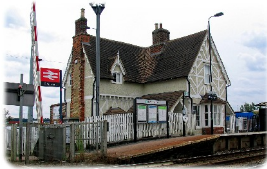
Ridgmont Station, Heritage Centre & Cafe

Refreshments and Toilets at Ridgmont Station and Heritage Centre, Woburn Safari Park Entrance, Ridgmont village.