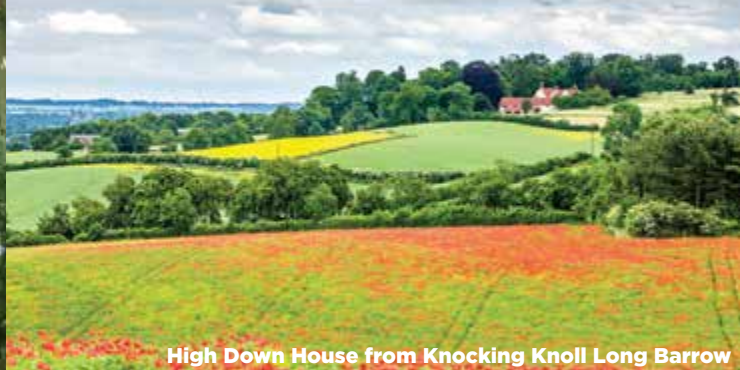
High Down House from Knocking Knoll Long Barrow