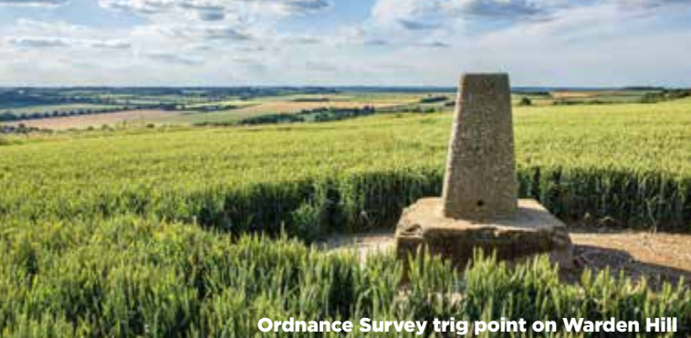
Ordnance Survey trig point on Warden Hill