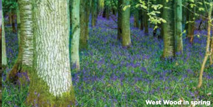
West Wood in spring