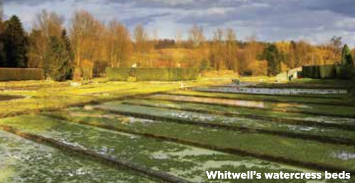
Whitwell's watercress beds