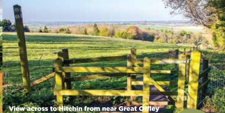
View across to Hitchin from near Great Offley

MORE DETAILS IN CHILTERN 213 & ON THE WEBSITE