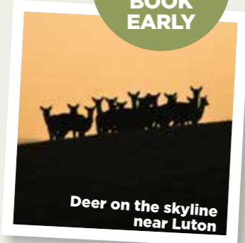
Deer on the skyline near Luton