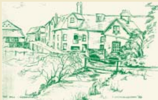
Greenfield Mill from an original sketch by Vera Merryweather

Starting at Flitwick Mill on the outskirts of Flitwick, the walk follows the River Flit, which used to power several mills in the area. The mill at Greenfield was demolished in 1971.